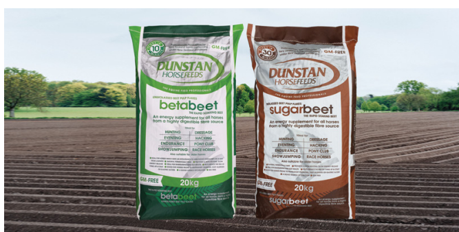
Dunstan Betabeet and Sugarbeet

Equifibre® Lucerne Pro and Equifibre® Meadow Pro provide further great additional fibre options. A 100% Lucerne product in Equifibre® Lucerne Pro and a pasture grass ensiled product in Equifibre® Meadow Pro.