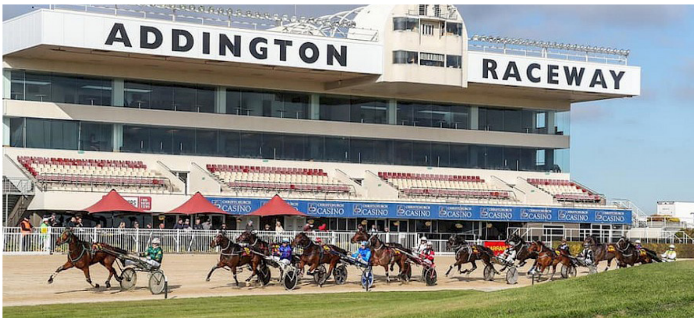
Harness racing has been playing out to empty stands at Addington but its turnovers have surprised