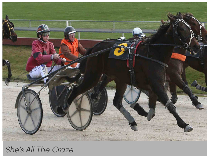
She's All The Craze