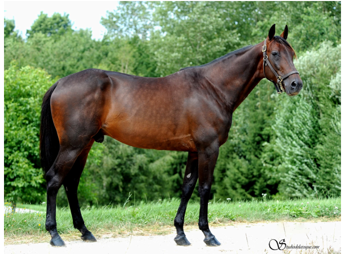
Bold Eagle (Ready Cash x Reethi Rah Jet - Love You)