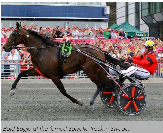
Bold Eagle at the famed Solvalla track in Sweden