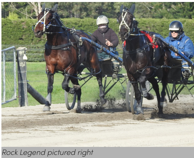
Rock Legend pictured right