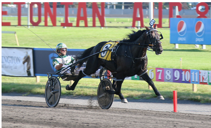
Tall Dark Stranger winning the Cane Pace for Three Year Olds