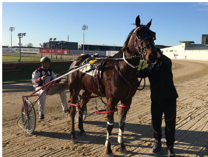
Invaluable returns to scale at Addington last Sunday