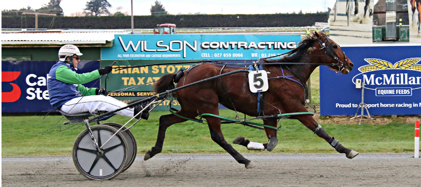
Smokin Annie produces an amazing burst to go from five deep the pegs at the top of the straight, to all alone in the finish