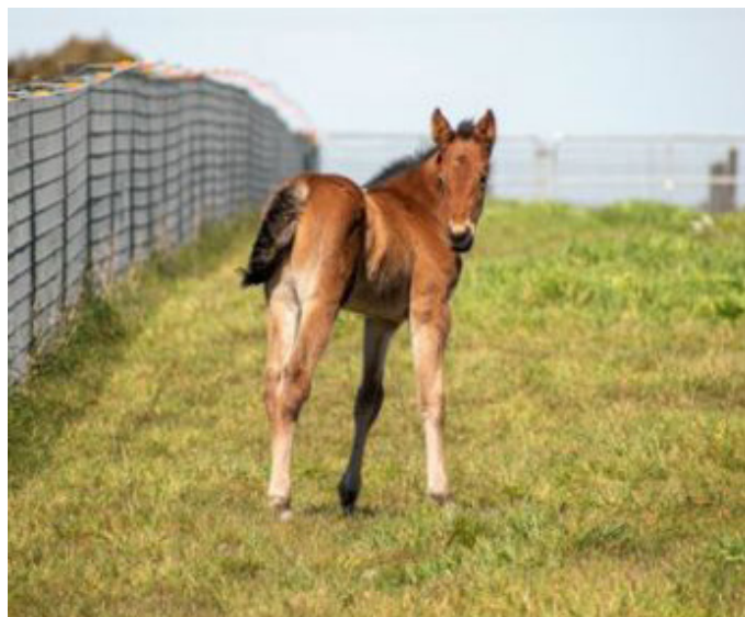
Volstead - Duchess Ella filly

Volstead was a top class performer on the track in Europe, with a career-best 1:51.5 in a racing career of 23 wins, and having him in Victoria provides breeders with a rare opportunity to add the influence of Cantab Hall to their bloodlines.