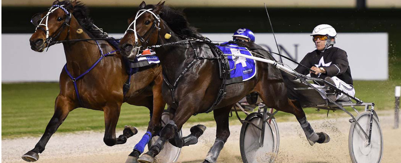
Bolt For Brilliance and Cracker Hill match strides after another epic tussle in the Group 2 Sires Stakes Final at Alexandra Park