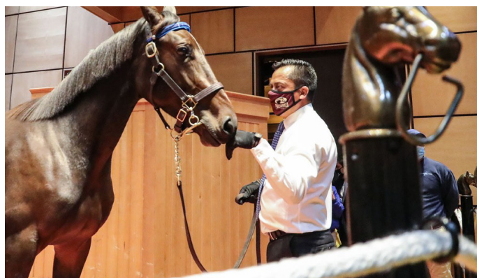
Kadena, a Walner filly out of Mission Brief, was the sale topper