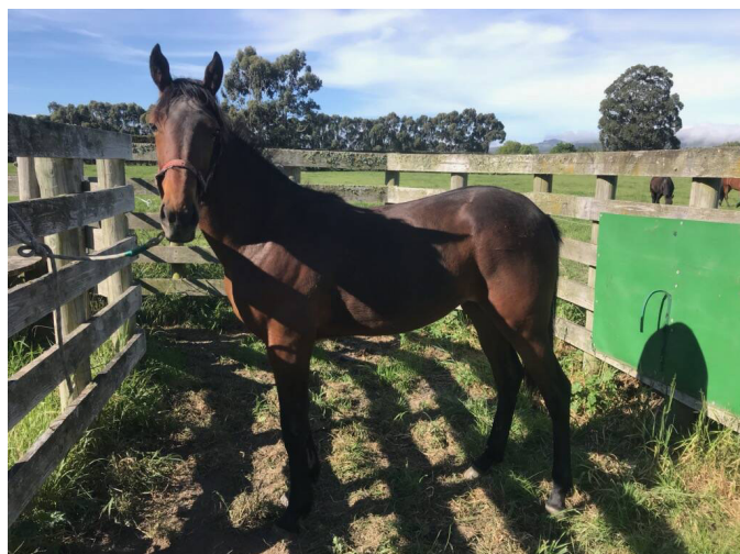
Bodacious: Father Patrick x Imagine That yearling