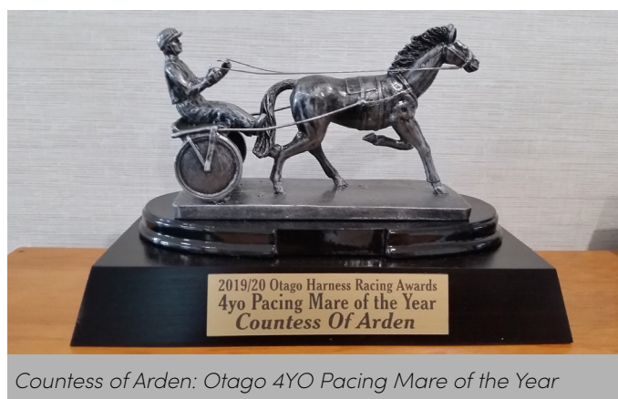
Countess of Arden: Otago 4YO Pacing Mare of the Year

While it hasn't been smooth sailing, it is encouraging to see the Arden Lodge team getting the results they work so hard for all year round.