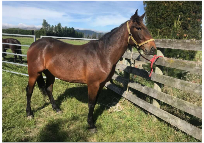
Hick Up: Andover Hall x Imagine That colt

This was a line that wasn't littered with champions, although some of the other tail lines would argue otherwise.