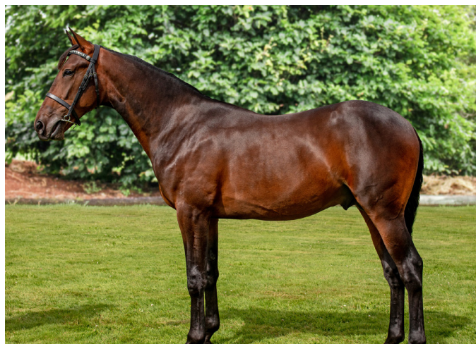
Lot 314 Sweet Lou x Crackabeach colt

“We had been buoyed by the fact that she had been out of her box for longer than she had been in it and it led us to make the decision of putting a $100,000 reserve.