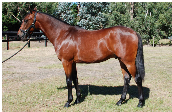
Lot 264: Art Major x When You're Hot colt

Being by a boom stallion out of a champion maternal family, it would be hard to argue with him.