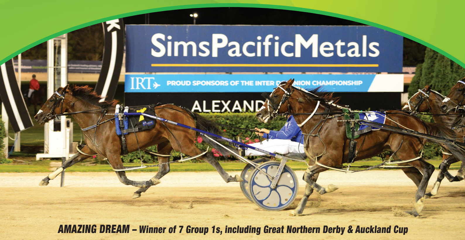
AMAZING DREAM – Winner of 7 Group 1s, including Great Northern Derby & Auckland Cup

SBSR presents its 2021 draft of 70 yearlings at the