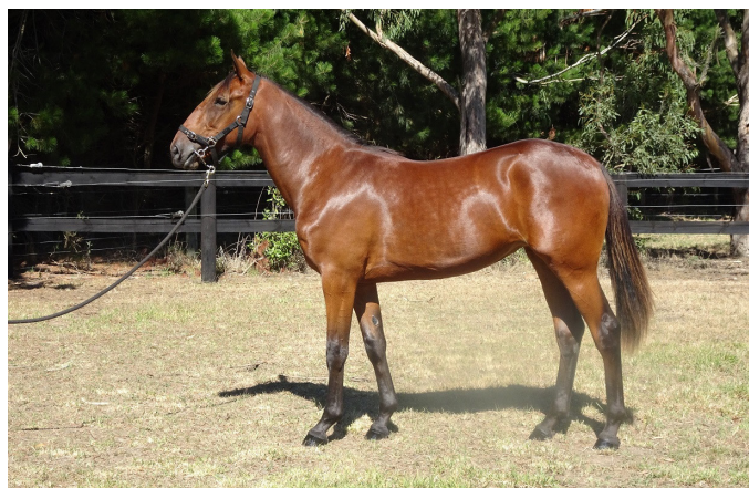
Lot 428: Captaintreacherous x Nikita Banner filly