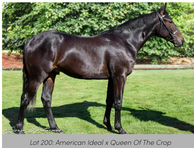
Lot 200: American Ideal x Queen Of The Crop

"She is also closely related to last year's sales topper Moet Shard and is a really nice filly. Perfectly correct and has everything in the right spot with her too," she said