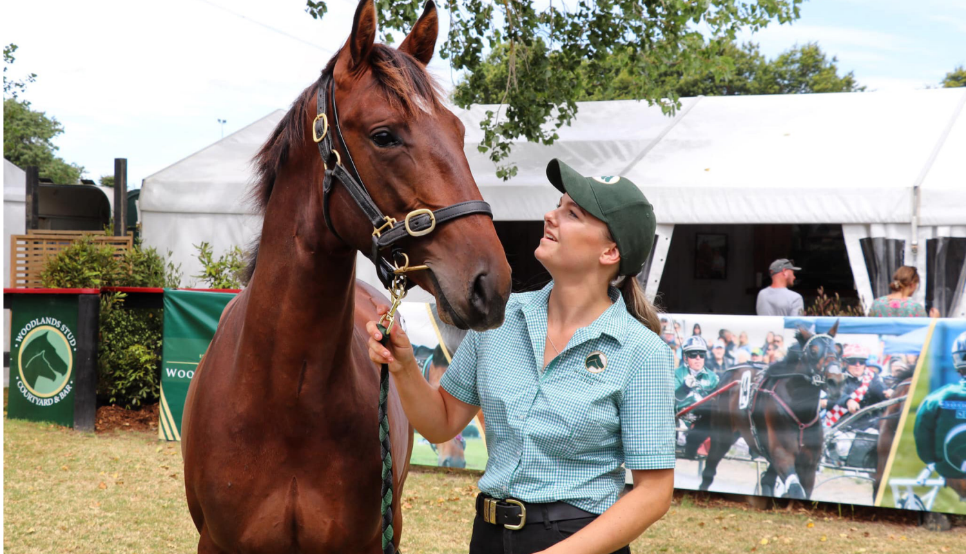
Lincoln Farms went to $200,000 to secure this Bettor's Delight colt out of Christian Cullen mare, Jessies Cullen.

"I've already taken a number of bookings for him next season off the back of his Karaka results."