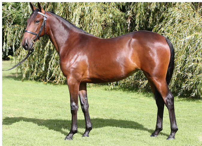
Lot 122 Bettor's Delight x Major Reality filly

"So with horseflesh I often use a similar mentality. If I get offered what I think if a fair price I will in most cases sell it. I am not a horse person. I have not grown up on a rural property or anything. What I know about horses is dangerous, outside of pedigrees and identifying abilities in a horse."