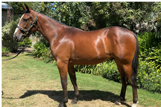
Lot 119: American Ideal x Lusty Mac colt