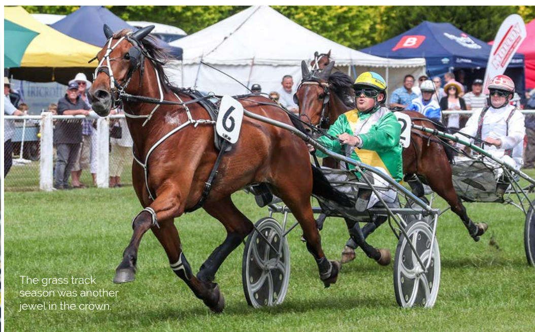
The grass track season was another jewel in the crown.