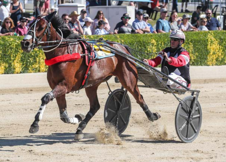
Sundees Son winning the Dominion.