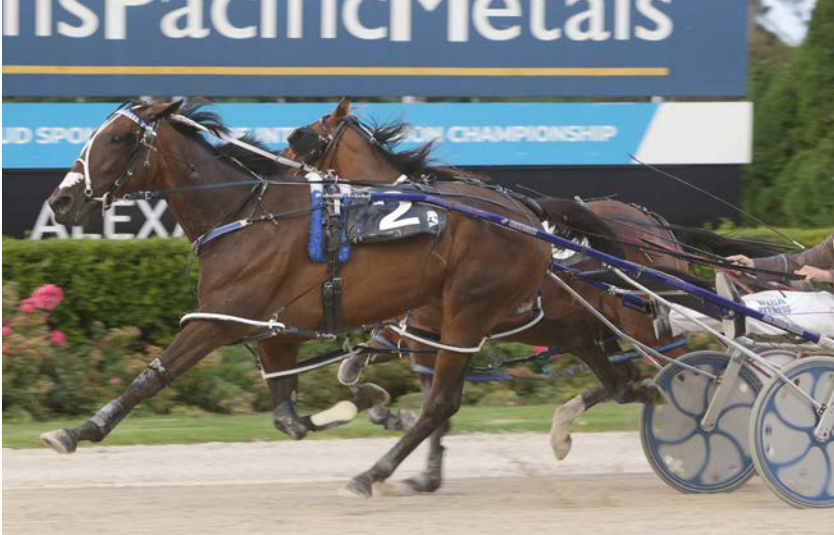
Bettor Twist winning the Northern Oaks.

and education assistant to focus on the traceability of our standardbreds when they retire from the sport. Rule changes will be presented to the 2021 AGM to further strengthen the horse care responsibilities of those persons responsible for the horse during its life in the industry.