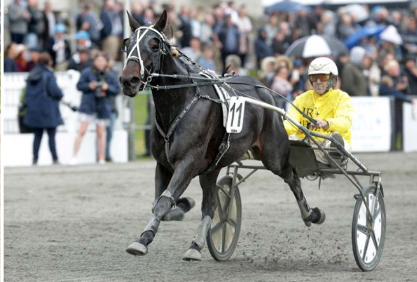
Bolt For Brilliance winning the 4YO Ruby.