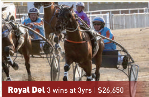
Royal Del 3 wins at 3yrs | $26,650