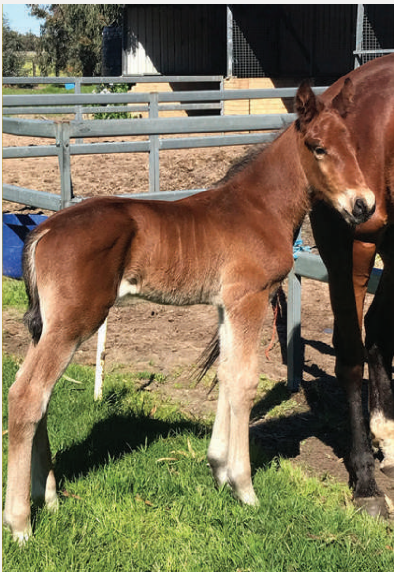
Captain Crunch progeny

"I think breeders just need to recognise that nowadays for these stallions that have also served mares in America, the second year is often the best year to breed to them commercially.