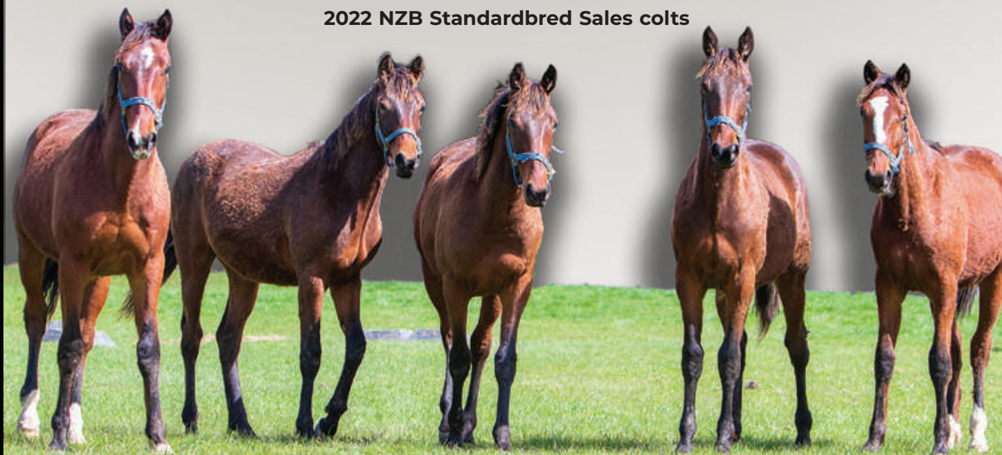
Art Major - Hot Hooves,