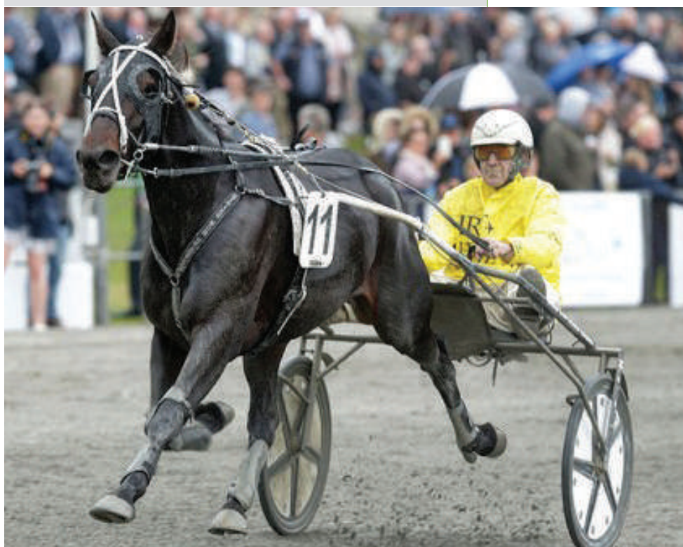
Bolt For Brilliance

Despite the huge differential between pacing and trotting purses Sundees Son's $400,000 in earnings rates right up there with the award's pacing contenders.