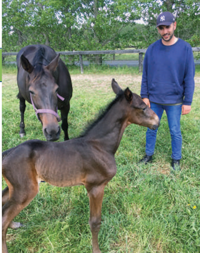
Brad, Too Much To Do & Bolt For Brilliance, 9 November 2016 at Dancingonmoonlight

We know for a fact that wagering around key carnivals such as the Miracle Mile and the Breeders Crown were up significantly with these races dates placed strategically to take advantage of the better climate and gaps in the sporting calendars.