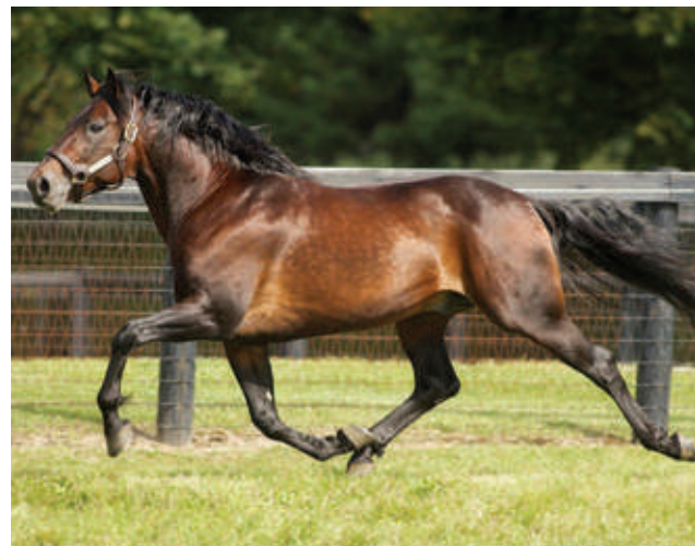
Majestic Son (Angus Hall line stallion standing at Alabar NZ)

Due to the dominance of Sundon for close on two decades, who could have speculated just a few years ago that NZ trotting breeders would have had access to top North American (Canadian and USA) and European (French) sires in the case of the three trotting stallion nominees.