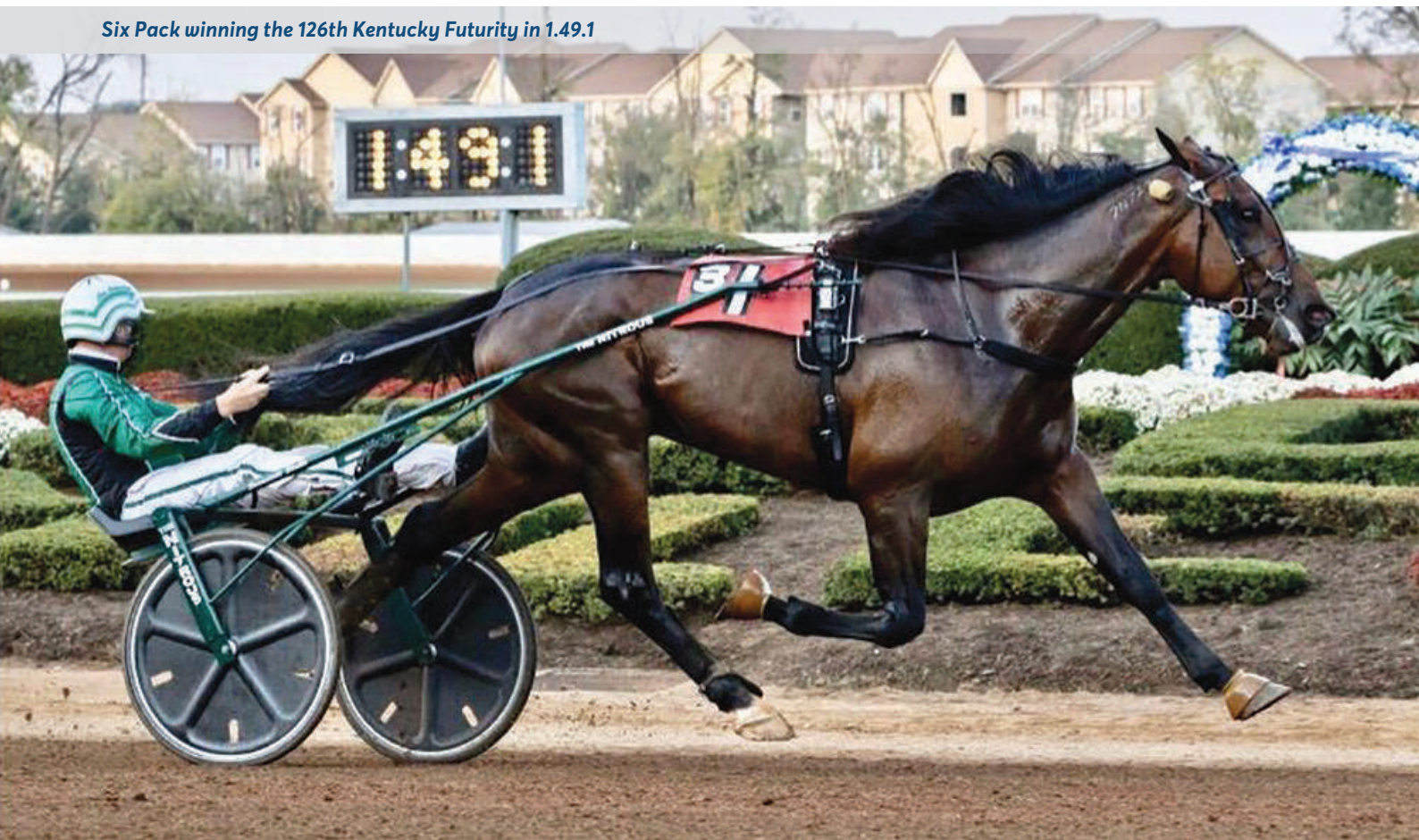
Six Pack winning the 126th Kentucky Futurity in 1.49.1

Timoko traces in male line through Imoko, Viking's Way and Mickey Viking to Bonefish, while his dam is by And Arifant, a son of the Italian champion trotter and sire Sharif Di Iesolo, a son of Quick Song.