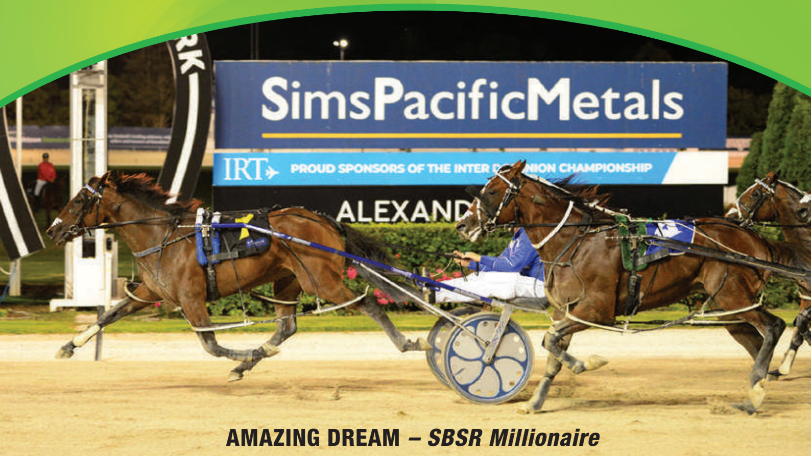
AMAZING DREAM – SBSR Millionaire

Southern Bred Southern Reared Rich Pedigree Rich Pasture