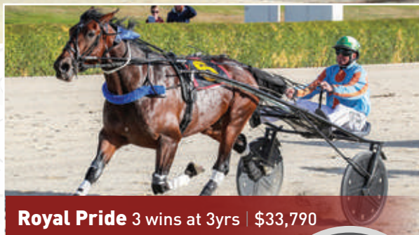
Royal Pride 3 wins at 3yrs | $33,790

Royal Aspirations had a "motor" that could break opponents hearts!