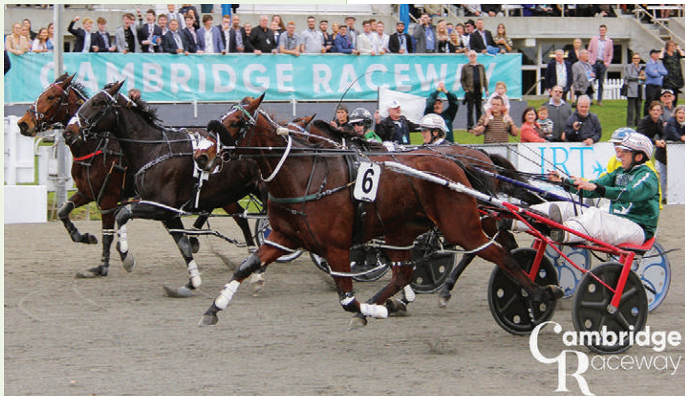
Need You Now winning the Four Year Old Diamond

He was the form three-year-old heading into the classics cut