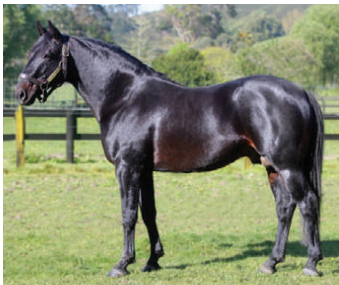
Bettor's Delight (Cam Fella line stallion standing at Woodlands Stud)

The all-time leading sire in harness racing history and the greatest sire of his generation. It is interesting to note at the time of writing that he trailed Somebeachsomewhere as leading pacing stallion in North America for 2021 by a slender margin of less than $90k, both over $13.3m in earnings (mid-September). His dominance of the local scene over the past decade continued in the latest season with stakes earned of $7.354m, second only to his record of $7.374m in 2018/19 season. His one hundred and ninety two pacing winners (195 overall) were slightly less than his three best seasons, highest of which was 2015/16 with 201 pacing winners (203 overall).