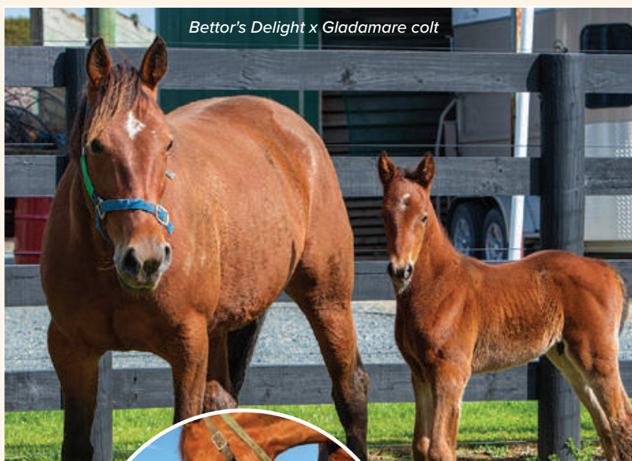
Bettor's Delight x Gladamare colt