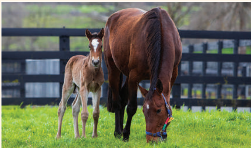
^ Sweet Lou x Carpen Dior filly