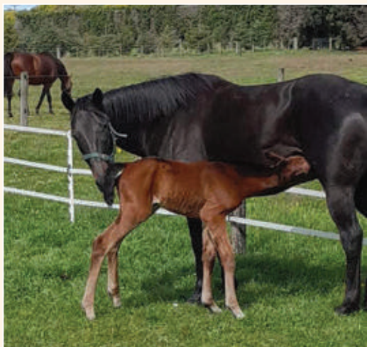
^ Captaintreacherous x Splendid Me filly